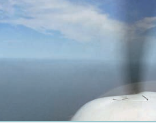
↑ ABOVE HAZE