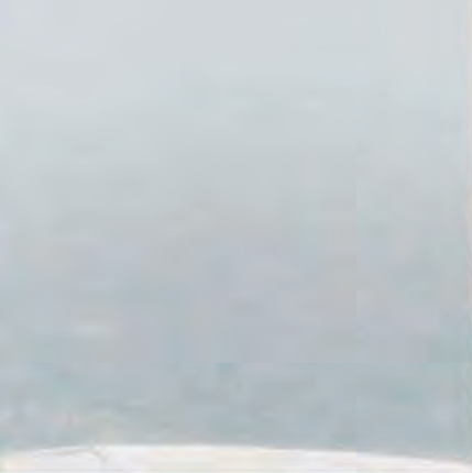
↑ HAZE (J)