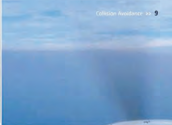
↑ OVERINVERSION (K)