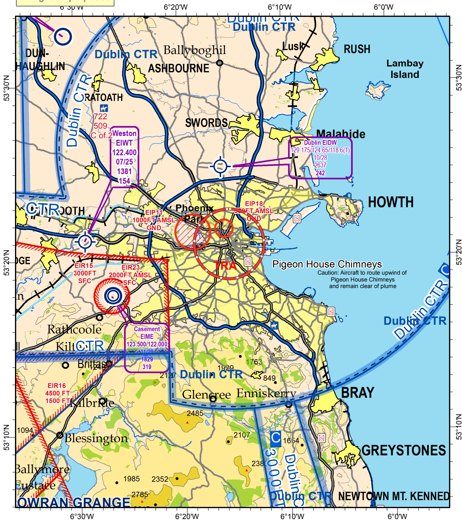
Chart not for navigation purposes

TRA No 1 & No 3 centered on 53 20 50N 006 15 32W