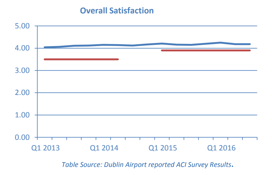
Figure [2]: Consumer Satisfaction at Dublin Airport