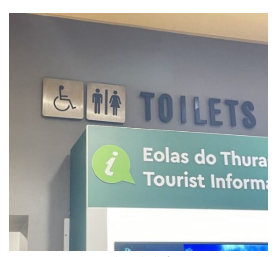
Figure 3 International Symbol of Access in Black and Silver for Above Tourist Information

Additionally, the signage throughout the airport is relatively uniform. Some signs are located above structures which results in them not being visible to the passenger. Example seen in Figure 3.