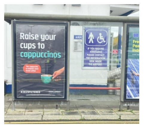
Figure 2 Bus stop outside the terminal building with a sign directing PRMs who require assistance

Additionally, the signage throughout the airport is relatively uniform. Some signs are located above structures which results in them not being visible to the passenger. Example seen in Figure 3.