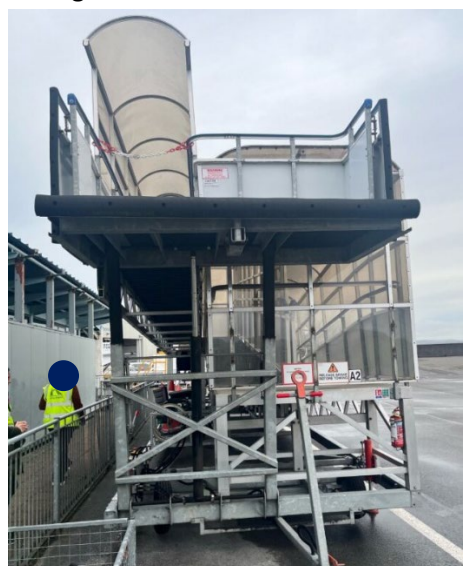
Figure 5 Aviramp

The airport has regular PRM users which enables staff to become familiar with users of the service and the assistance they require. PRMs receive assistance by all customer service staff embarking or disembarking the aircraft. If a PRM requires assistance for beyond this point i.e., WCHC (assistance through the airport and to the cabin seat on the aircraft) and WCHS (assistance through the airport and up the stairs of the aircraft) this assistance is provided by the ground handlers. Kerry Airport purchased two Aviramp as there are no air bridges in the airport for embarking and disembarking the aircraft. Aviramps are structures that provide a ramp from the ground up to the door of the aircraft. See Figure 5 below.