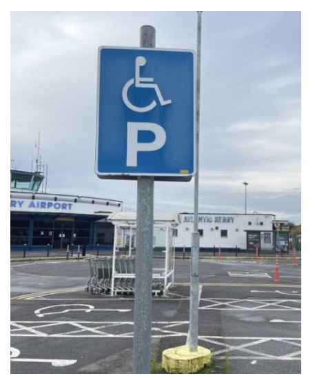
Figure 1 Disabled Parking Sign with International Symbol of Access in Blue and White