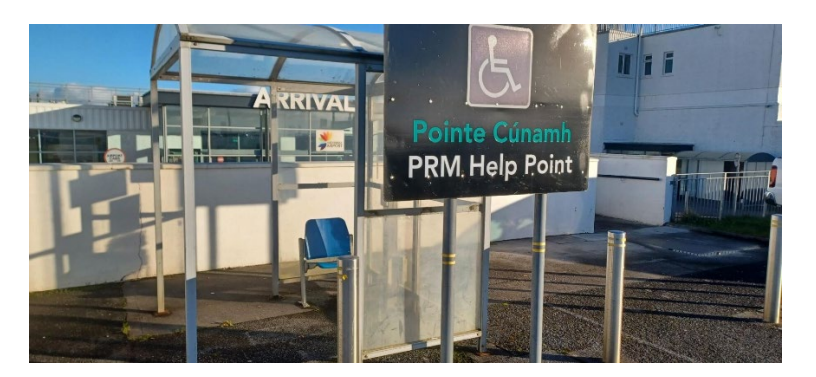
Figure 3: External PRM call point, alternative angle showing the seat