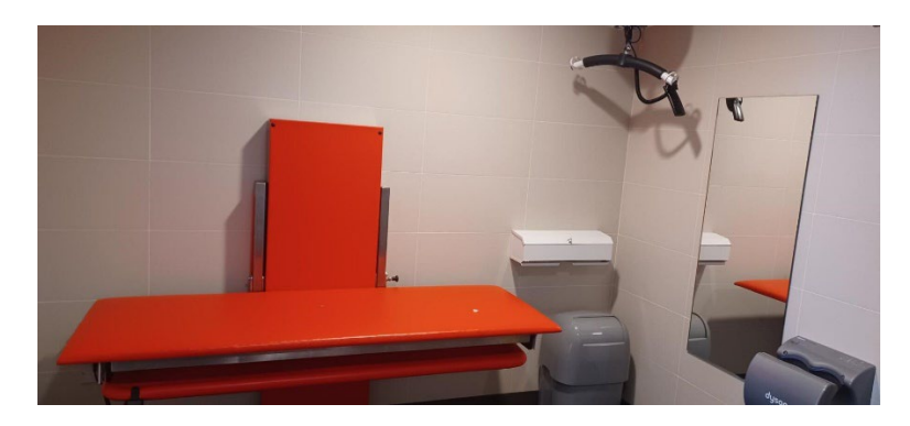
Figure 5: Hoist and changing facilities

Ireland West Airport continues to be an accessible airport for people with reduced mobility and disabilities. There has been innovation by the airport with regards to implementation of changes received from passengers. An example of this was the addition of a hoist in one of the accessible bathrooms in the arrivals area to enable passengers to use changing facilities if needed.