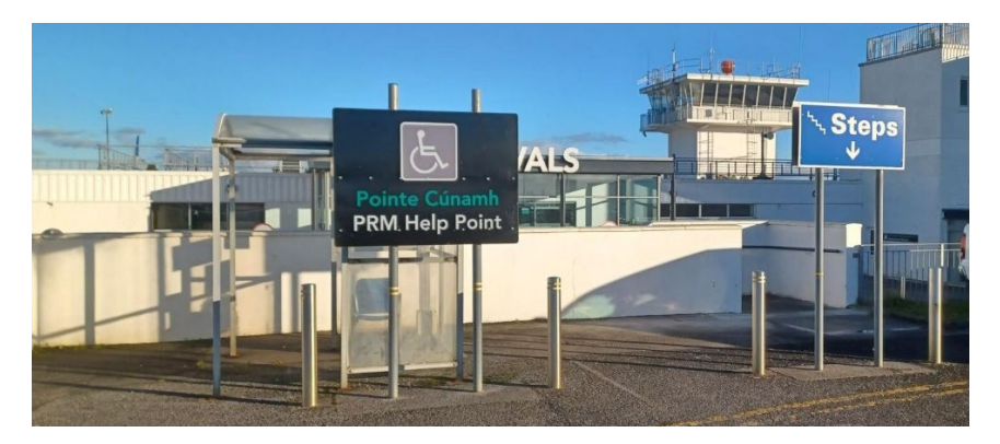
Figure 2: External PRM call point with covered seat area

the forefront of any updates to this area. Additionally, the departure and arrival doors of the airport are in very close proximity to the disabled parking spaces, with a mobility ramp leading to the airport's entrance. The mobility ramp was clearly signposted, as were the accessible parking spaces which were painted with the international symbol of access.