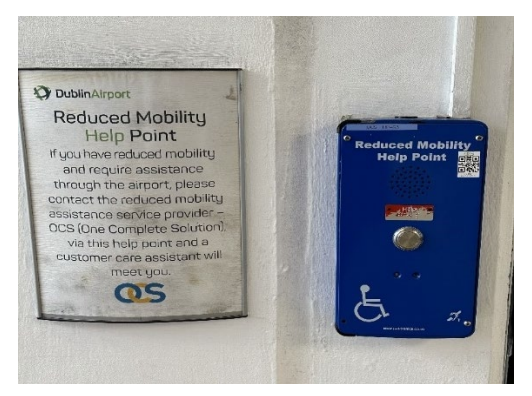
Figure 2: Call point located across from Terminal 1 adjacent to T1 Short Term Car Park

The points of arrival and departure shall (as per the Regulation) be clearly signed and shall offer "basic information about the airport, in accessible formats." The ability for a PRM to announce their arrival upon entering the airport boundary is an important and sometimes critical beginning to their air travel. Announcing one's arrival and receiving timely assistance ensures the passenger has a stress-free journey and is not delayed for their flight. Accordingly, this article addresses two significant aspects of the airport's compliance: call points and signage.