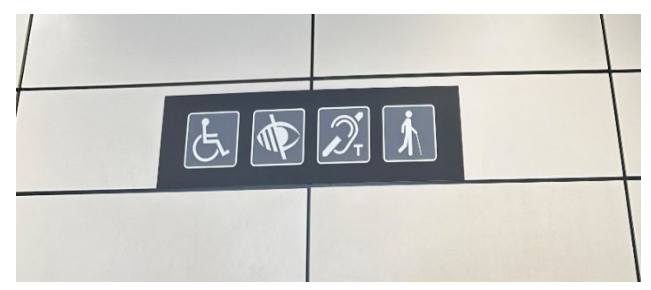
Figure 3: Signage for PRMs in black, white, and grey