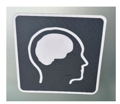
Figure 4: Sign indicating Hidden Disabilities in white and dark grey

The inspection began in the building directly opposite Terminal 1 in Dublin Airport, The Atrium. This building is the first point of entry for passengers arriving on a bus or from the Short Term Car Park. As detailed on Appendix A of this report, the 2022 findings indicated that upgrades were needed to the call points, especially the passenger point of arrival from the car parks and bus drop-off at Terminal 1. At the time of the 2023 inspection (September 2023), the call point system had not undergone an upgrade and the IAA inspection team encountered the same findings as the 2022 inspection in relation to location, volume, and signage of the call point. Based on the IAA's findings, the airport initiated a plan to upgrade the call point system, which began in Spring of 2024. This plan is currently ongoing, and updates are being provided to the IAA regarding same.