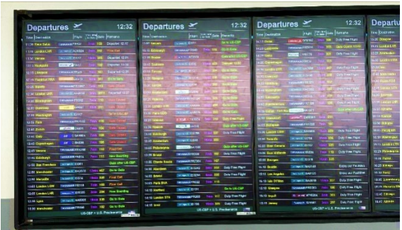
Figure 8: High Contrast screens with flight information

The high contrast screens were implemented with the assistance of Vision Ireland (National Council for the Blind Ireland (NCBI)). 11 See Figure 8 below.