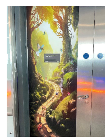
Figure 7: Door to Sensory Room Terminal 2, Dublin Airport

one provides a welcome addition to assisting neurodivergent passengers, thereby ensuring hidden disabilities are also considered.